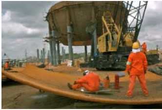
PEMEX Refinery Upgrade, Mexico