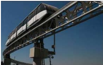
Mexico City International Airport Expansion