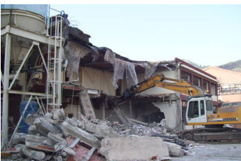
Demolition and decommissioning of the Barnices Valentine site in Barcelona

CH2M HILL is a global company leader in full-service engineering, procurement, construction, and operations for public and private clients. With more than $6.4 billion in revenue and 25,000 employees worldwide, CH2M HILL delivers innovative, practical, sustainable solutions—helping clients develop and manage infrastructure and facilities that improve efficiency, safety, and quality of life.