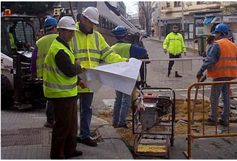
ONO, Telecommunication Network Rollout